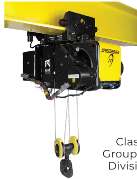
EX Hazardous Location Hoist

Designed for demanding, heavy-duty applications