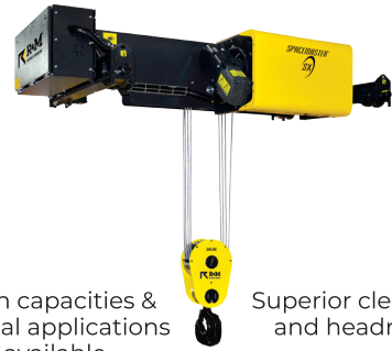
SX Double Girder Trolley

High capacities & special applications available