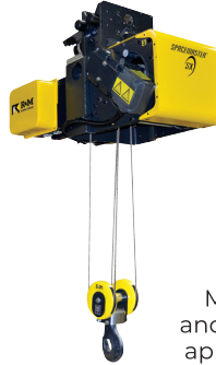
SX Normal Headroom Trolley