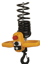
Digichain™ Ergonomic Controls

Most economical low headroom chain hoist in the industry