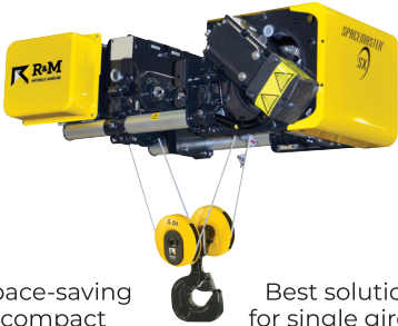
SX Low Headroom Trolley