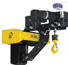
Low Headroom Trolley

Most economical low headroom chain hoist in the industry